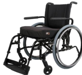
Quickie QXi featuring the Jay ION™ cushion