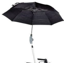
// 7109060 $244.00 Umbrella, black