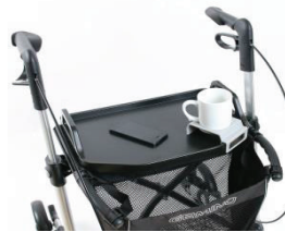
// 7109140 $98.00 Table tray