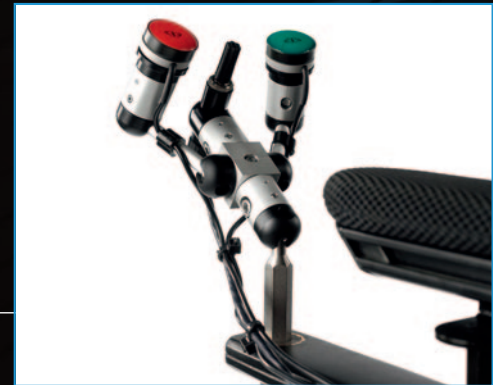
Mini Joystick with Extra Switches