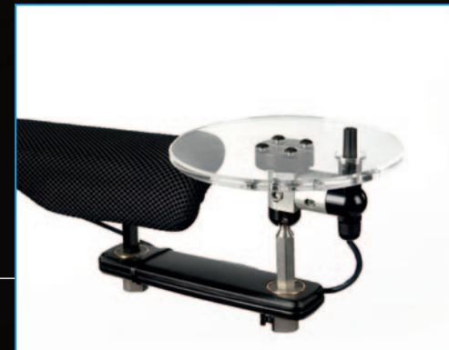
Mini Joystick on a SunDisk