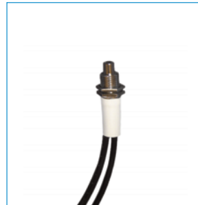
Fiber Optic Switch