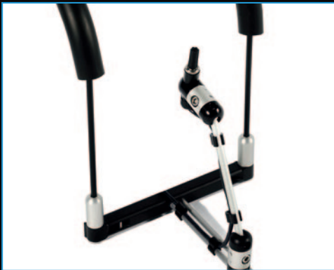
Mini Joystick on Chin Harness