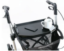
// 7109140 $97.00 Table tray