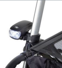
// 7109095 $119.00 Light