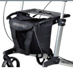
7104007 Bag, advanced, black/black $119.00