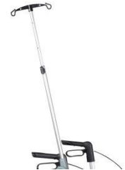
// 7109100 $244.00 Infusion holder