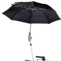
// 7109060 $244.00 Umbrella, black