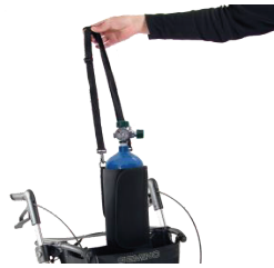
// 7109050 & 7109051 $244.00 Basket for oxygen cylinder*