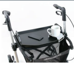
// 7109140 $98.00 Table tray