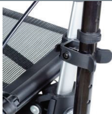
// 7109011 $98.00 Crutch holder