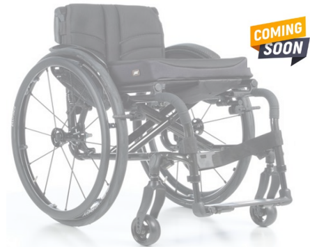
QS5 X - Fixed Front