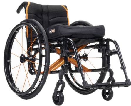
QS5 X - Swing Away