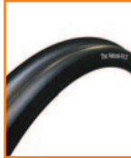
Natural Fit LT**