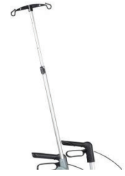
// 7109100 $244.00 Infusion holder