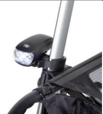
// 7109095 $117.00 Light