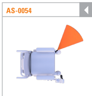
Braze Hydra Kit