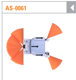
Braze Sentina Plus Kit