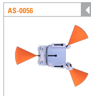
Braze Hydra Trio Kit