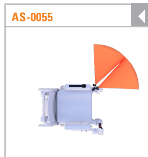
Braze Hydra Duo Kit