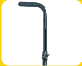
Swing-Away, Adjustable Stroller Handles • Adjusts in height • Folds in for storage