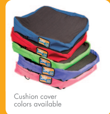
Cushion cover colors available