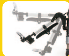
Elevating/Articulating Legrest (available on ZIPPIE IRIS) • 2" of height adjustment aligns pivot point with knee joint

Other options, not pictured, are also available.