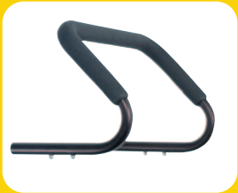
Removable Extension • Comfortable hand positions • Rigidizes back canes • Mounts upward or downward