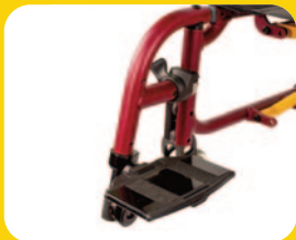
Swing-In/Out Extension Tubes (available on ZIPPIE IRIS & ZIPPIE X'CAPE) • 80°, 70° & 60° angles • 3 extension tube lengths