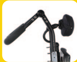
Height-Adjustable, Angle-Adjustable Push Handle • 260° of rotation • User-friendly thumb button release