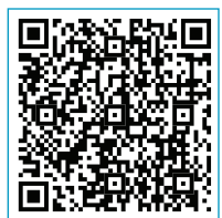
Manual Wheelchair Web Page