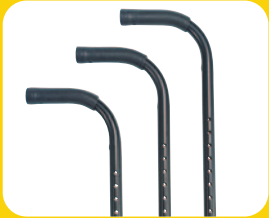
Stroller Handles 21" 23" 25" LOW MED HIGH