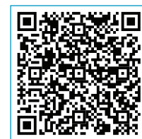
Power Wheelchair Web Page