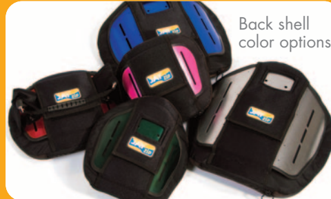
Back shell color options