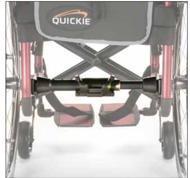
Folding Chair Receiver Bracket and Removable Axle Assembly