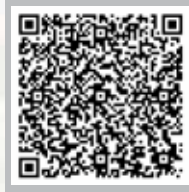
R90 Web Page