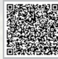
R90 Order Form