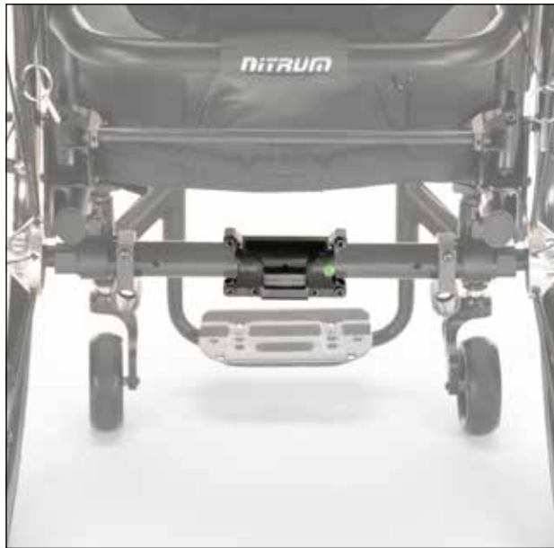
Rigid Chair Receiver Bracket

THE CONTROL BOX can be ordered for either right or left-hand use and can be mounted anywhere on your frame tube.