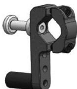
Tilt-In-Space Flat Surface Clamp