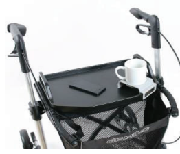
// 7109140 $97.00 Table tray