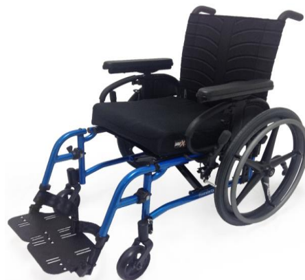
Quickie QX featuring the Jay X2™ cushion