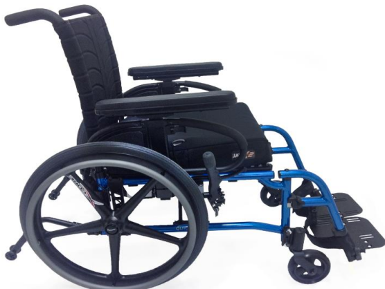
Quickie QX, Ultra Lightweight Folding Wheelchair