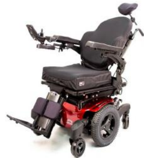
QM-710™ MPC Shown w/ optional Seat Elevator