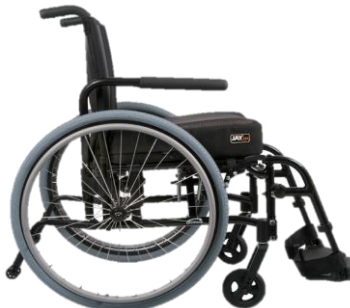
Quickie QXi, Ultra Lightweight Adjustable Folding Wheelchair