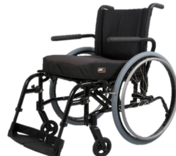
Quickie QXi featuring the Jay ION™ cushion

ORDER INFORMATION: Customer Service: 800-263-3390 Fax: 800-561-5834 www.sunrisemedical.ca