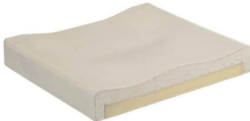
Cross section view

The JAY GO foam base is designed to contain an accommodating seating surface in a thicker, softer dual layered foam base. The optimal combination of two different foam densities provides skin protection.