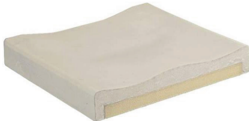
Cross section view

The JAY GO foam base is designed to contain an accommodating seating surface in a thicker, softer dual layered foam base. The optimal combination of two different foam densities provides skin protection.