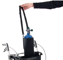
// 7109050 & 7109051 $240.00 Basket for oxygen cylinder*