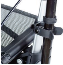
// 7109011 $97.00 Crutch holder