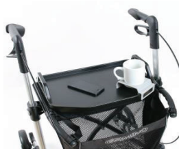
// 7109140 $97.00 Table tray